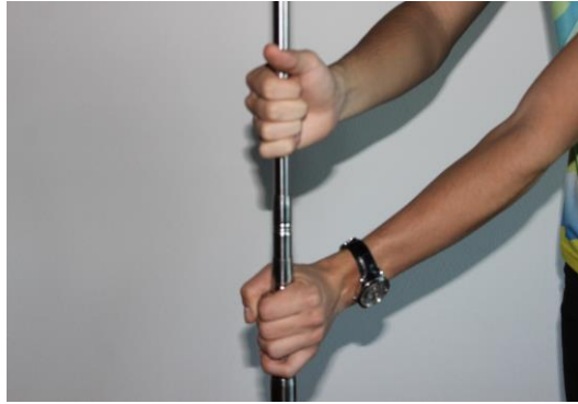
Turn counterclockwise and push up.