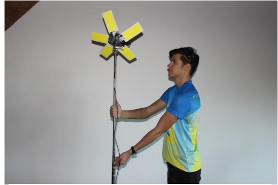
Rotating clockwise fixes the selected height.